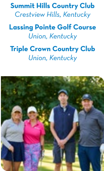
EVENT STATISTICS Over 500 golfers, including some of the region's top executives, influential professionals and community leaders.