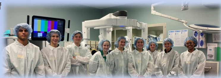
Several 2023-2024 interns during a recent Surgery tour at Edgewood.

Interested students can learn more about the program by calling Volunteer Services at 859-301-2140.