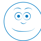
Hurts Little Bit