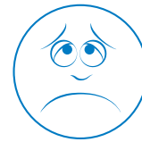
Hurts Whole Lot