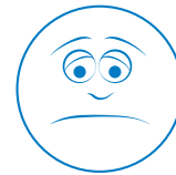
Hurts Even More