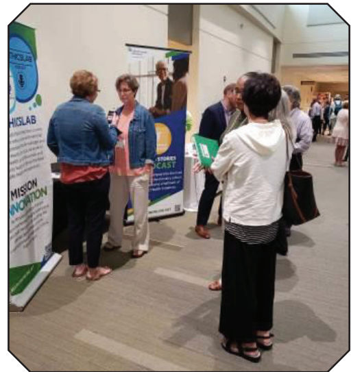
2018 Conference Exhibitors

For complete information on exhibiting, please visit our Conference page at HMAAssoc.org