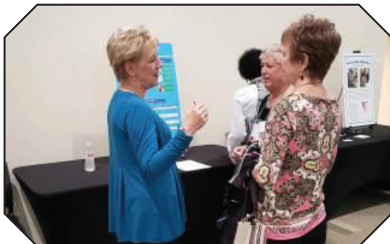
2018 Conference Poster Presentation