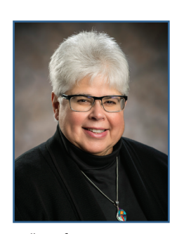
"Finding Meaning in Caring"