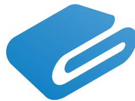
BLANKET WARMERS FOR HOSPICE