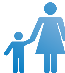
SUPPORT FOR MOTHERS & CHILDREN IN NEED